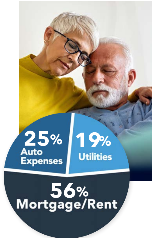
How Patients Use Grants

The FCS Foundation hosts fundraising events throughout Florida to raise money to support our mission. We rely on the support of our volunteers, donors and sponsors to make our life-changing work possible.